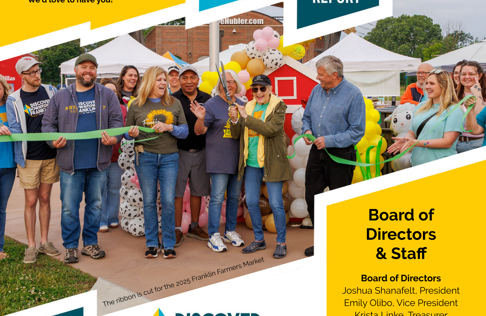
The ribbon is cut for the 2025 Franklin Farmers Market