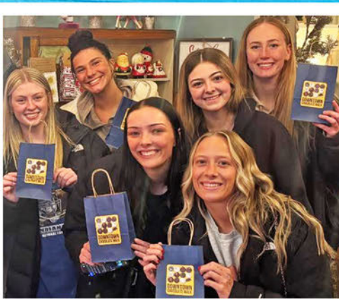
Chocolate Walk participants