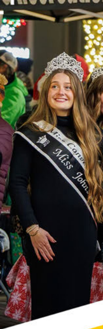
▼▼▼ Ms. Johnson County reacts to the courthouse lighting